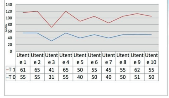
Fig. 3 - FPS scale scores