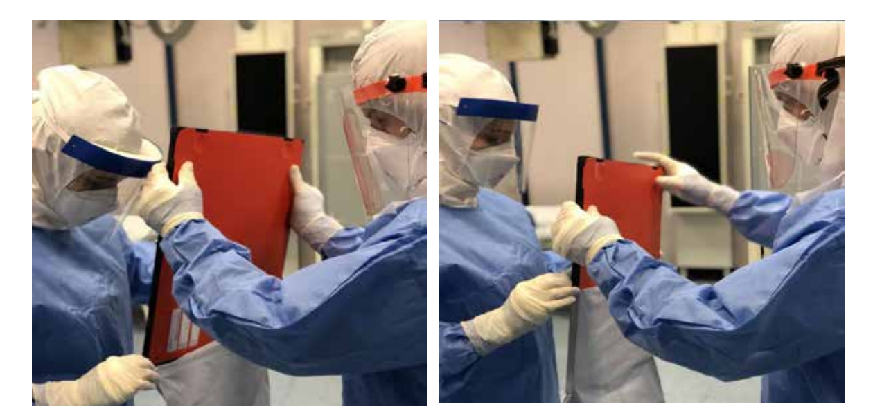
Image 4 - Listing Procedure of X-ray box into the water repellent envelops.